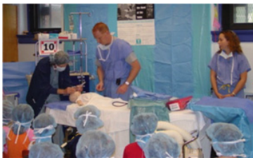
Colfax Elementary School