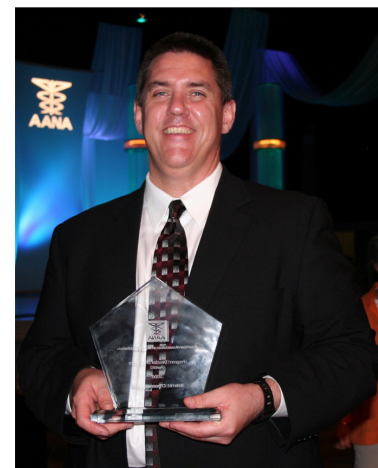
Presented at the AANA Annual Meeting Cleveland, Ohio, August 2006

About the American Association of Nurse Anesthetists: Founded in 1931 and located in Park Ridge, Ill., the AANA is the professional organization for more than 33,000 Certified Registered Nurse Anesthetists (CRNAs). As advanced practice nurses, CRNAs are the hands-on providers of 65 percent of the anesthetics delivered in the United States each year. CRNAs practice in every setting where anesthesia is available and are the sole anesthesia providers in more than two-thirds of all rural hospitals.